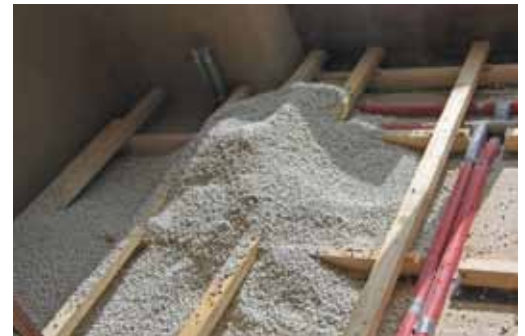
Easy to handle loose fill