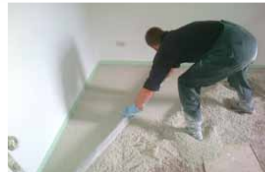
GEOCELL foam glass bubbles: bound fill